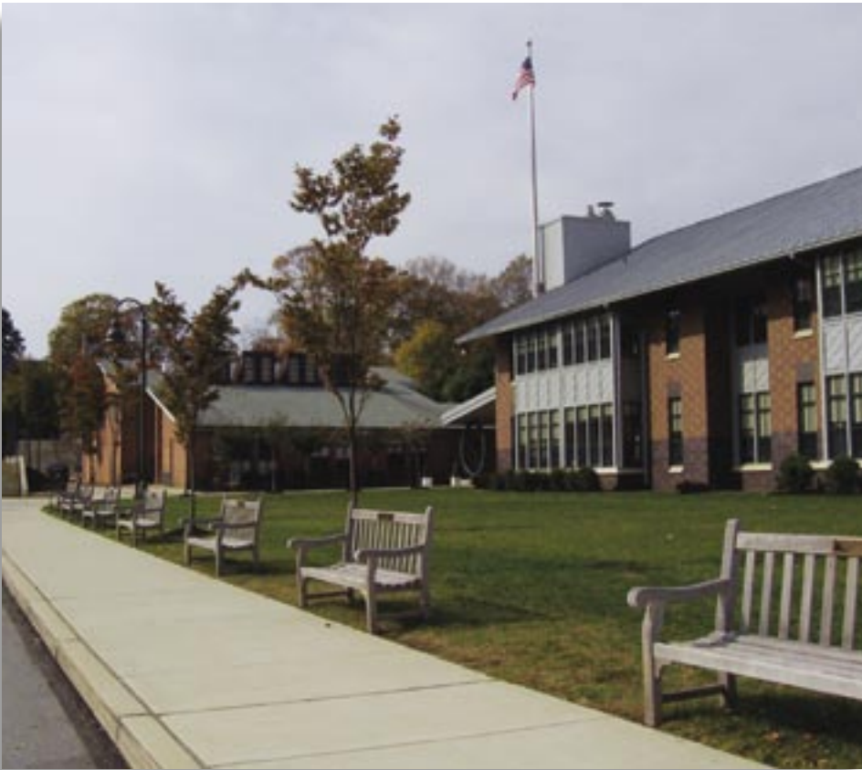
Left, the new classroom entrance at The Shipley School Lower School campus.

new Friends' Central School Fannie Cox Center for Science, Math and Technology which houses state-of-the-art classroom and research facilities, and forms the cornerstone of a new campus green. This building was designed by Graham Gund Architects of Cambridge, MA. GTP provided landscape architectural services for the project, including plans for a rehabilitated "campus green", student drop