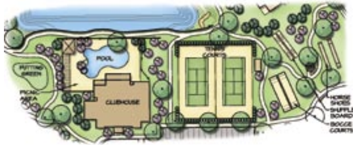
Left, The Traditions at Hamilton Crossing recreation area.

provided for an age qualified community by Pulte Homes called Traditions at Hamilton Crossing in Hamilton Township, Mercer County, and for Canal Walk in Franklin Township.