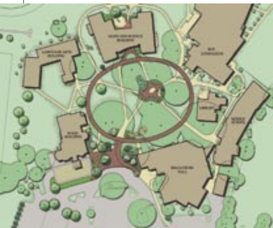
Above, the Friends' Central School campus green.

G TP has been involved with the expansion plans for several prominent educational institutions in the region. Schools are often faced with limited land for growth and modernization, and in their need to adapt to changes in their programs, are almost always faced with neighborhood concerns. In addition, schools built 50-100 years ago are often limited within the campuses as to where new buildings may be located. GTP has teamed with the school administrators, their boards and architects to plan exciting new facilities and to conserve historic buildings.